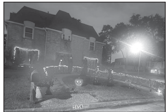
First Place 3854 Villa Ridge Ct.