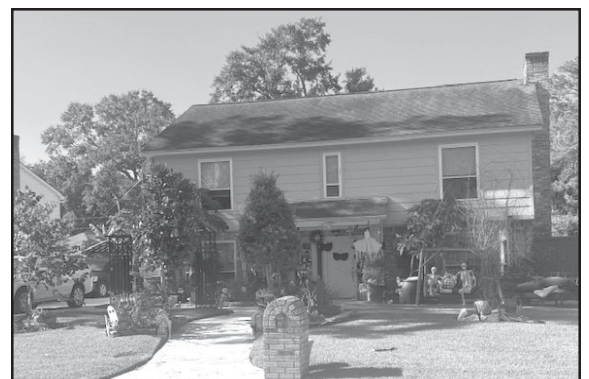
Second Place 3842 Fairvalley